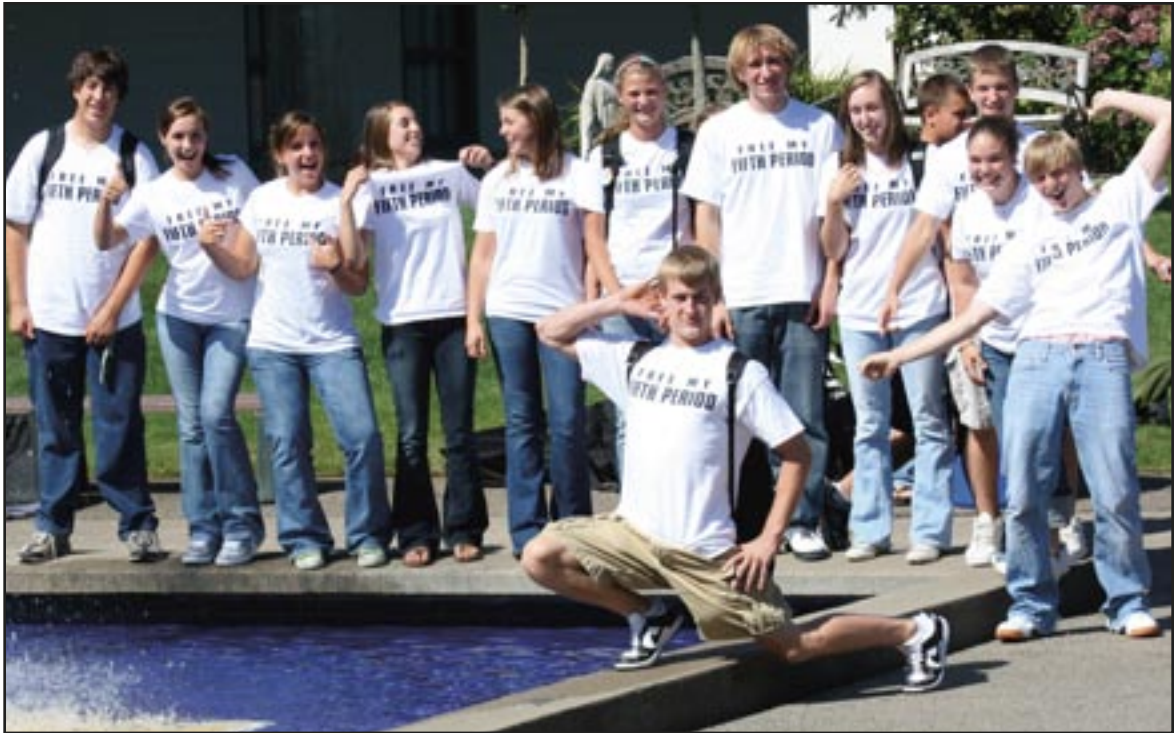
A small group of Marist seniors show their passion for the "Free Our Fifth" Movement.